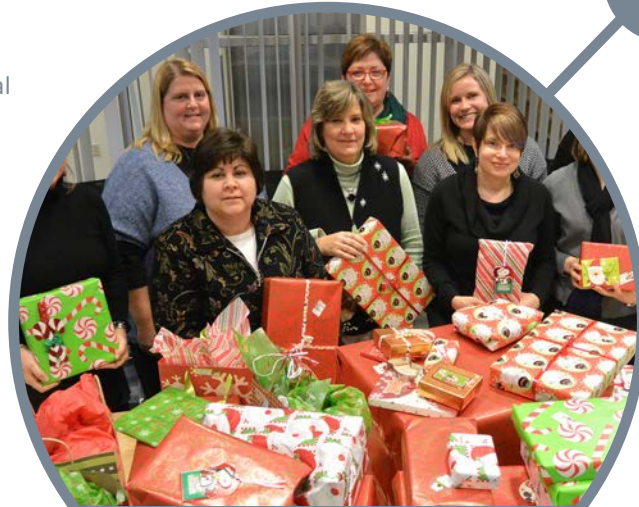
HCRN staff prepare gifts for our "secret family" during the 2013 holidays.